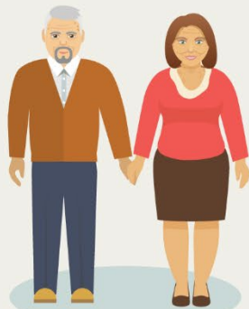
GRANDFATHER | GRANDMOTHER