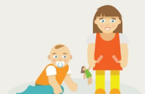
COUSIN | COUSIN