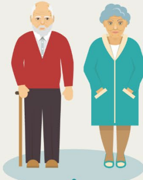
GREAT-GRANDFATHER | GREAT-GRANDMOTHER