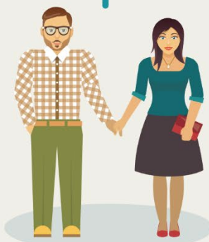
UNCLE | AUNT