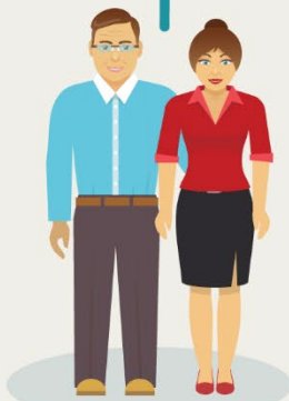
FATHER | MOTHER