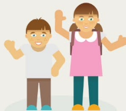
COUSIN | COUSIN