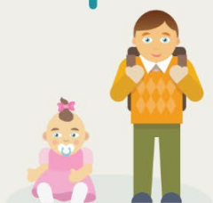
SISTER | ME