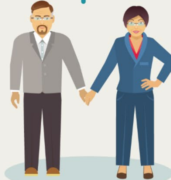
GRANDUNCLE | GRANDAUNT